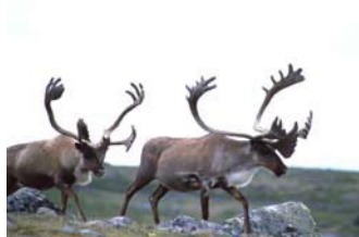
Snow Camp, Fall 2004

Most airline companies will require that boxes and antlers be double-wrapped and they will provide bags for this purpose. Please allow enough time for this procedure.